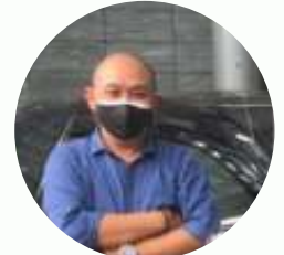
Mr. Danang Shuttle driver

Our shuttle cars service passengers between Capital Place and SCBD, every week day. A car is scheduled to arrive every 15-20 mins, subject to prevailing traffic conditions. The shuttle cars are an ideal service for users of the MRT, as an extension transport from and to Capital Place Office. If you want to travel to the SCBD area at lunchtime, again the shuttle service can assist your transportation needs. Our shuttle cars can be identified with smiley face icon displayed on the windscreen of the vehicles. For further information, please contact our Concierge at lobby reception.