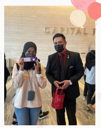
Kindness in words creates confidence. Kindness in thinking creates profundity. Kindness in giving creates love. - Lao Tzu