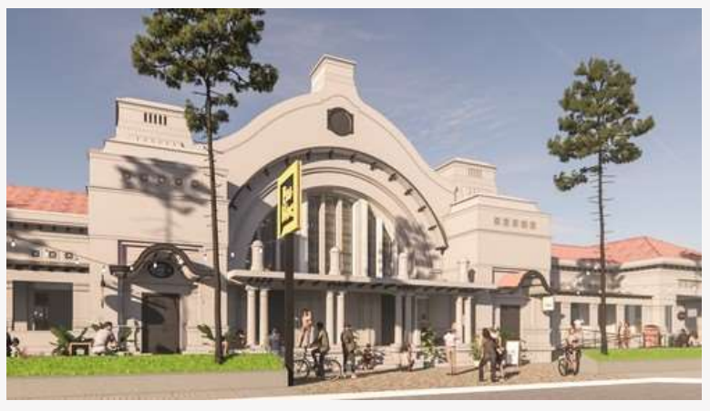
Jl. Pos No. 2, Pasar Baru, Jakarta Pusat